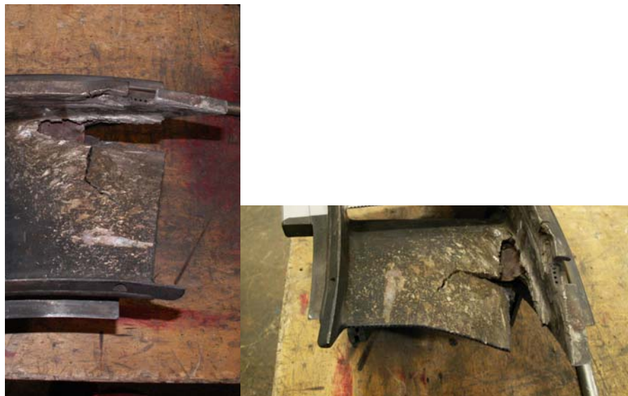
Figures 1 and 2. Foreign Object Damage to a First Stage Nozzle Segment - A perfect candidate for a trailing edge replacement coupon.

To learn more about the company, its unique repair process or to check a list of in-stock parts, visit www.Frarendi.com or call +1 (317) 333-7650.