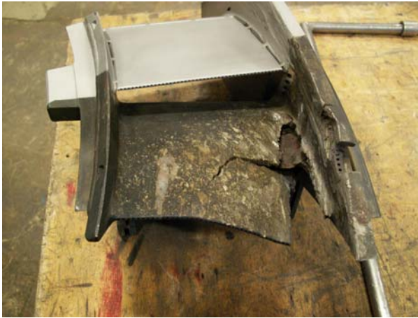
Figure 6. Trailing Edge Coupon shown ready to be welded into place. Note the small trailing edge cooling holes and the extent of damage to a nozzle segment that can be repaired.